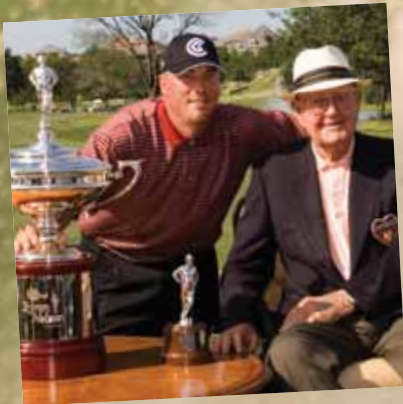
Defending 2006 Champion, Brett Wetterich and Mr. Byron Nelson.